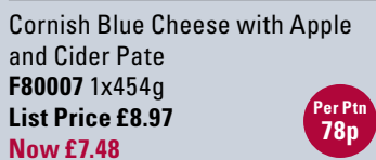
Cornish Blue Cheese with Apple and Cider Pate F80007 1x454g List Price £8.97 Now £7.48