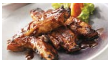
Delux BBQ Sauce A523 1x3.78ltr List Price £7.20 Now £6.45