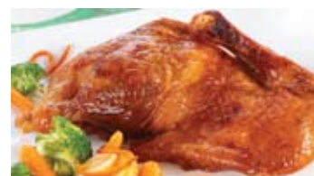
Honey Roast Half Duckling 300g F30459 1x10 List Price £42.86 Now £38.00