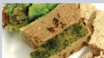
Smoked Mackerel and Toasted Walnut Pate F80006 1x454g List Price £8.51 Now £7.48