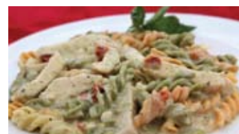
Chicken Pasta Alfredo 450g F83042 1x12 List Price £35.10 Now £23.07