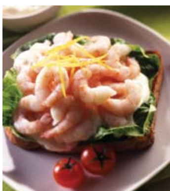
Glenmyr Luxury Prawns (U150) F60066 1x2.5kg List Price £18.28 Now £11.88