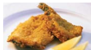
Breaded Butterfly Lemon Sardines F60965 1x1kg List Price £9.40 Now £6.33