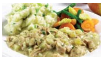
Pork and Magners Cider 340g F82849 1x12 List Price £28.50 Now £19.25