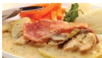
Somerset Chicken Breast 340g F85032 1x12 List Price £36.89 Now £33.00